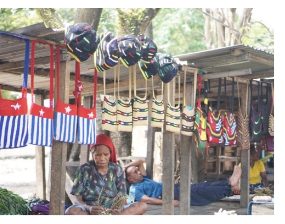
Figure: Traditional market sells handicrafts that symbolize the West Papua flag in Sentani, Jayapura.